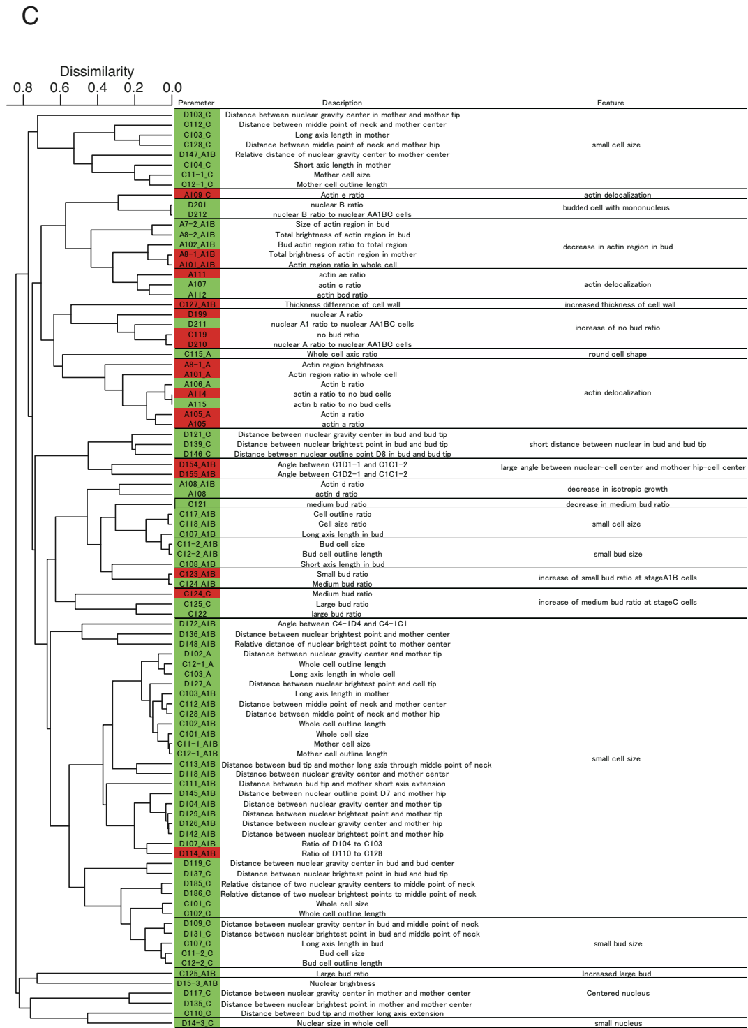
FIGURE S3.—Morphological features of each class. (A)-(C) represent lists of parameters showing characteristic changes in classes I-III, respectively. The red and green colors in the ‘Parameter’ column indicate increases and decreases ( P < 0.001 ) in parameter values of fsI mutants ( P < 0.001 ), respectively. Dissimilarity indicates the value based on the rank-order correlation coefficient (see Materials and Methods, Ohnuki et al. 2007).