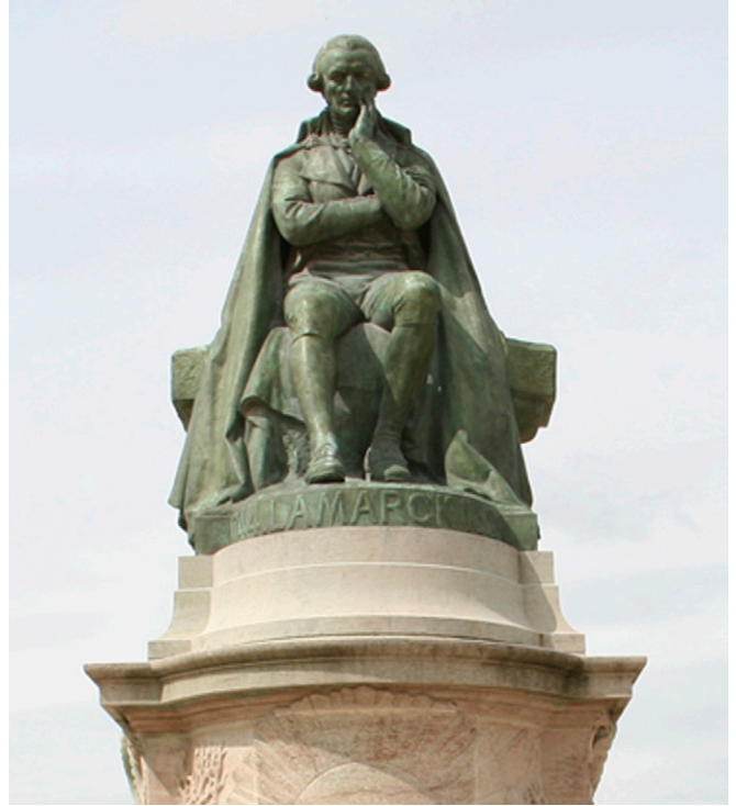
Figure 2 The statue of Lamarck at the Muséum d'Histoire Naturelle in Paris. The statue was erected in 1909, the centenary of the publication of Lamarck's Philosophie zoologique.